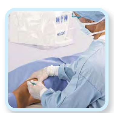
Laser alignment light.